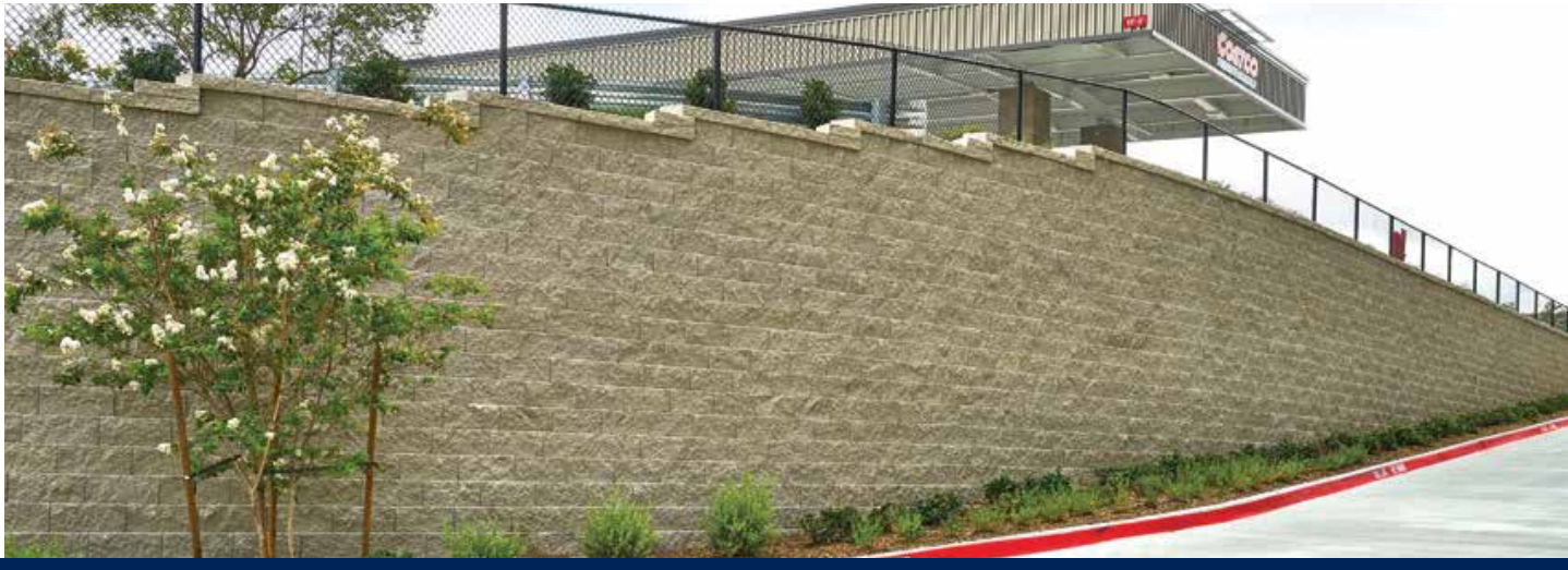
Visit one of our showrooms or learn more at midlandconcreteproducts.com

8"h x 18"w x 12"d (203mm x 472mm x 305 mm) Unit Weights: 76 lbs (34 kg) Units/sq.ft.: 1