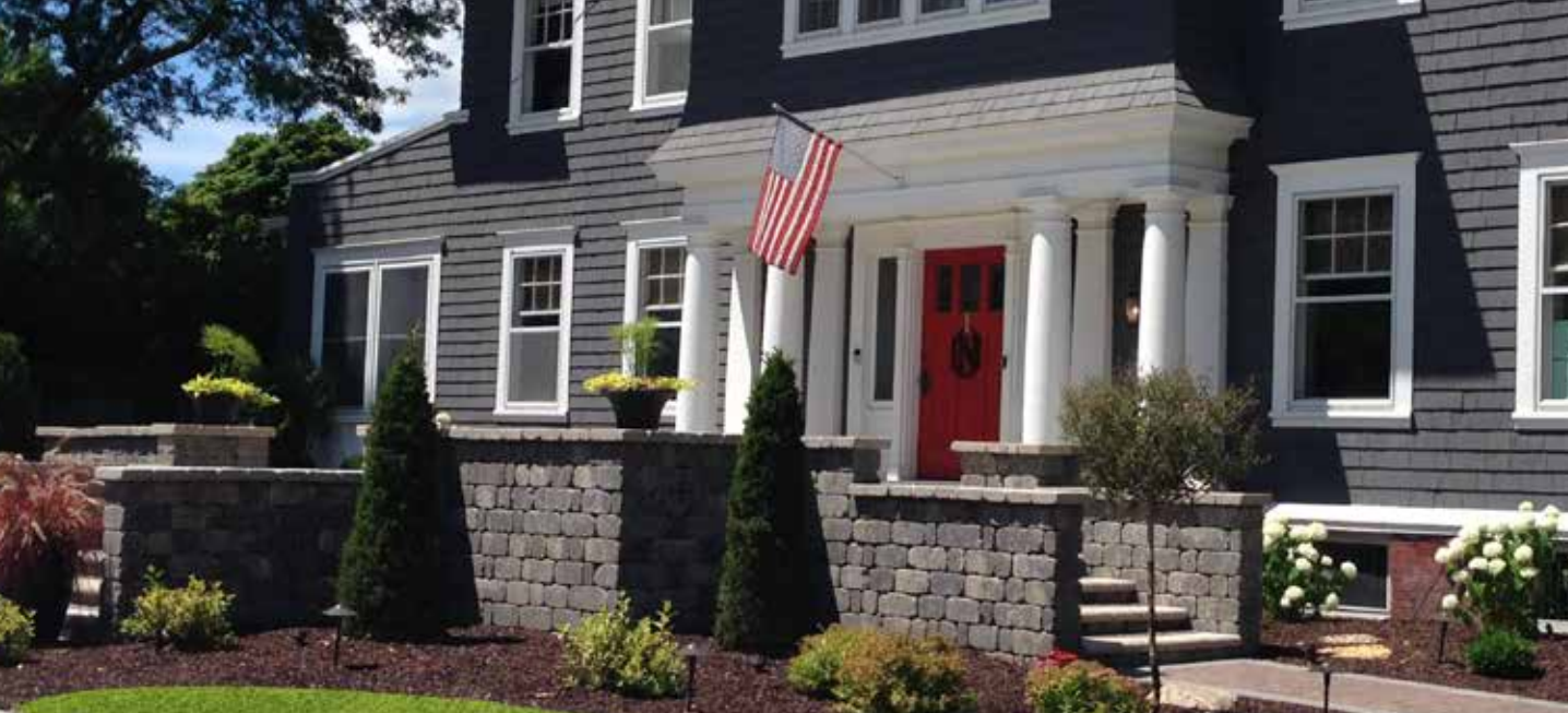
Visit one of our showrooms or learn more at midlandconcreteproducts.com