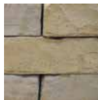
FOND DU LAC