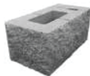
Hard-Split Corner 8 x 18 x 9