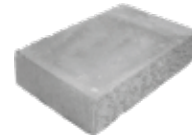
4" Hard-Split Cap 4 x 15 \frac{1}{8} x 9 \frac{3}{8}